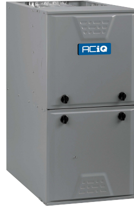
Illustrations and photographs are only representative. Some product models may vary.